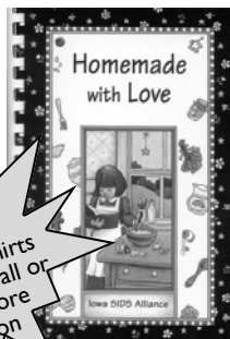
Cook Book 130 Pages, Spiralbound