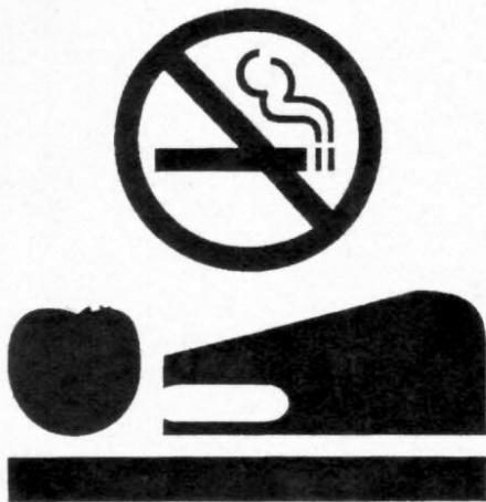
Stop smoking around the baby