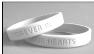
Forever In Our Hearts Light Purple Silicone Bracelet